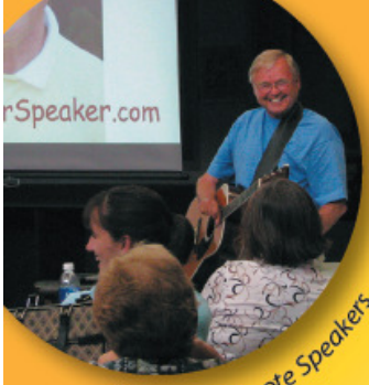
Relevant Keynote Speakers