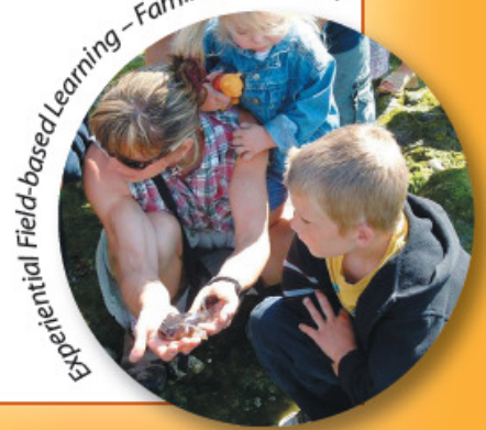
Experiential Field-based Learning - Families Welcome!