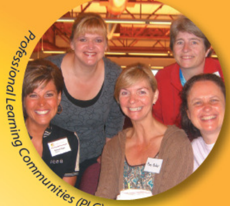
Professional Learning Communities (PLC)

Enjoy a fast-paced week of learning, remembering why you teach.